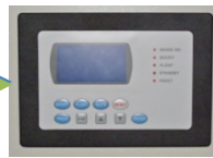
LCD Multifunctional Panel